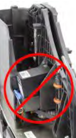
Push down on the cartridge to fully seat