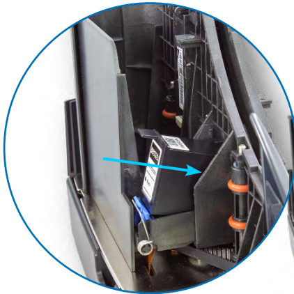
Insert the ink cartridge at a slight angle

Important: The top of the cartridge should appear level or flat when it is fully seated.