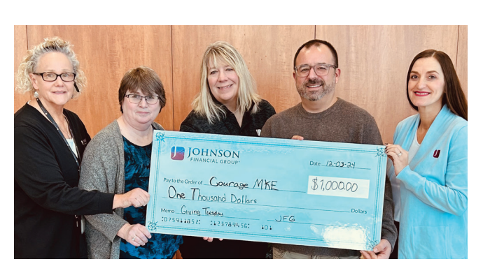
FRANKLIN TEAM DONATES ON GIVING TUESDAY

MOST CHARITABLE CORPORATION IN WISCONSIN