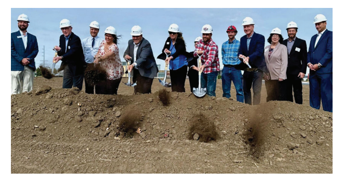
SUN PRAIRIE LOCATION GROUNDBREAKING