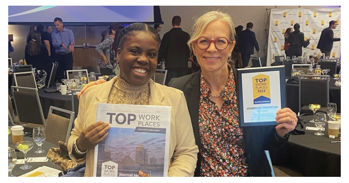
MILWAUKEE JOURNAL SENTINEL TOP WORKPLACES CEREMONY